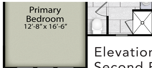
Elevation B Second Floor