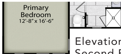
Elevation C Second Floor